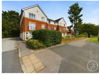
Communal gardens with residents on-site parking.